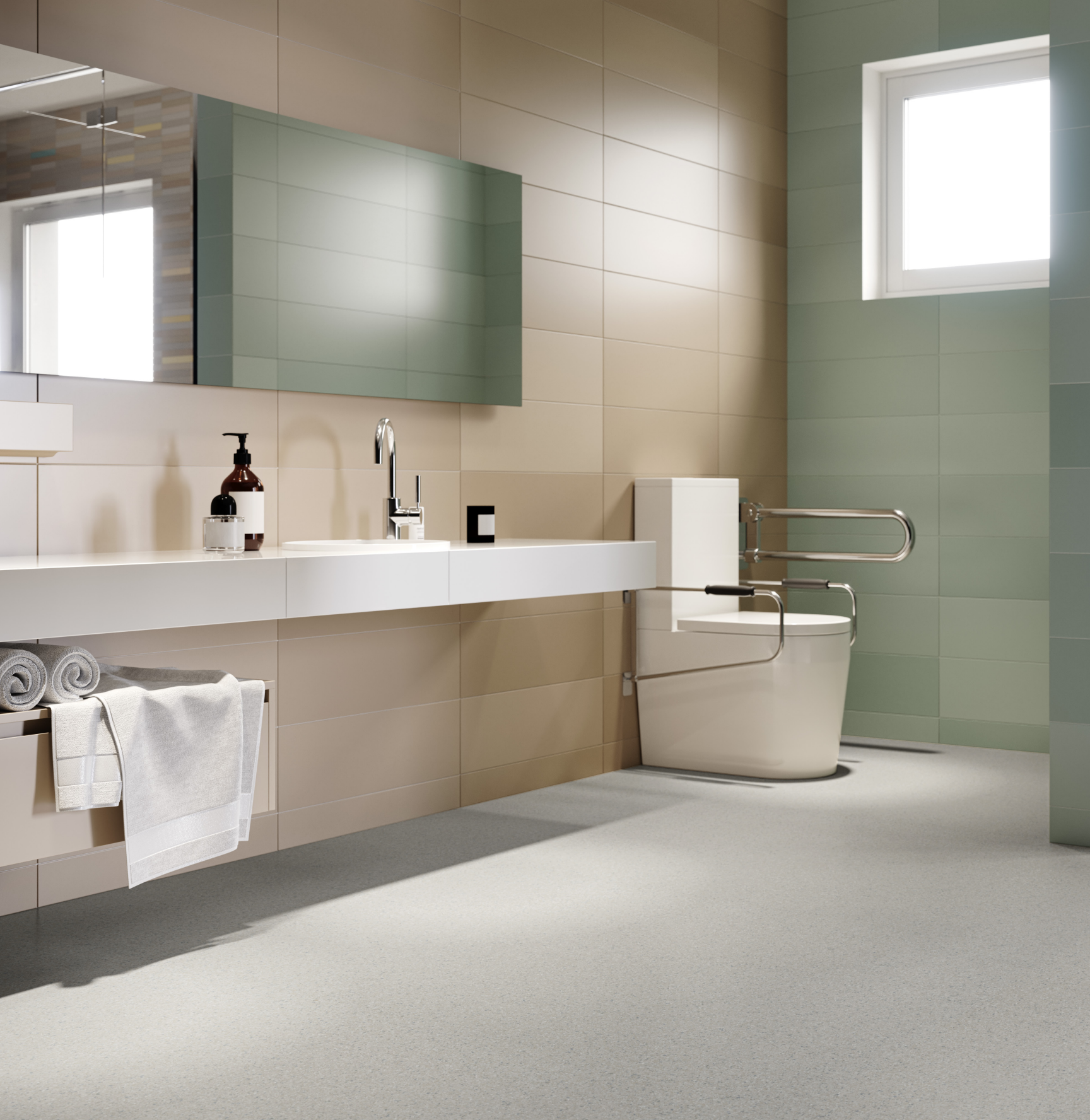
Cover: BioSpec® SR - Northstar 67506 Above: BioSpec® SR - Mojave 67525 (Previously Talpa 67418)