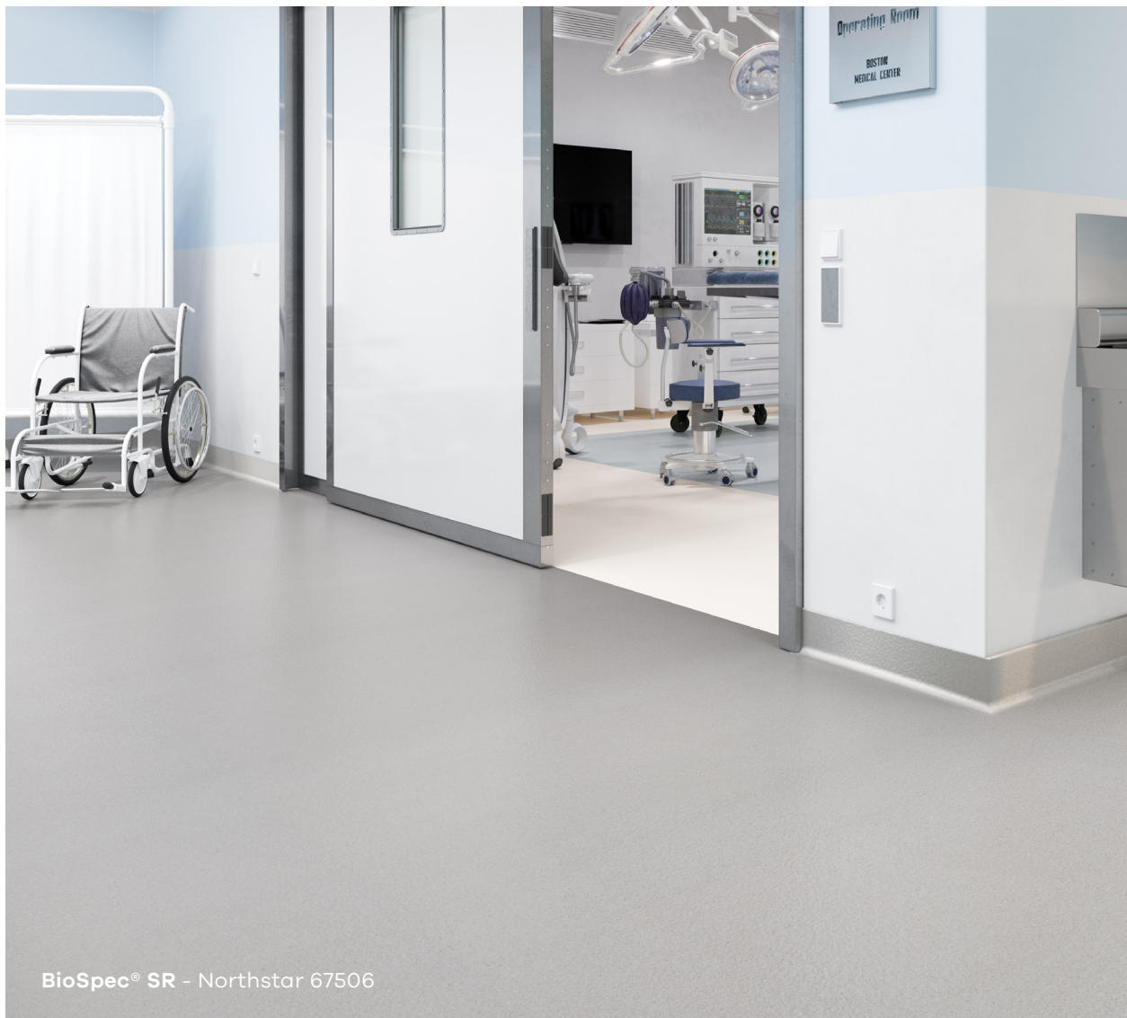
BioSpec® SR - Northstar 67506

Healthcare facilities are not “one product fits all” places. At Mannington Commercial, we incorporate evidence-based design to create flooring that fits the unique needs of different spaces. Rigorous performance testing ensures BioSpec® SR is a slip resistant, high performance, low maintenance flooring solution.