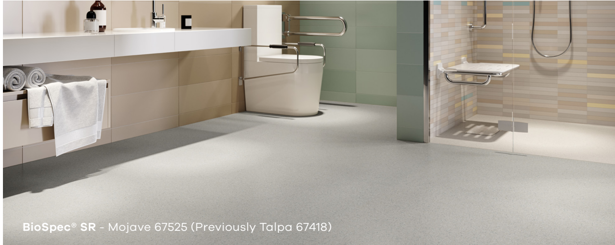
BioSpec® SR - Mojave 67525 (Previously Talpa 67418)