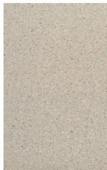
New Glacier 67364