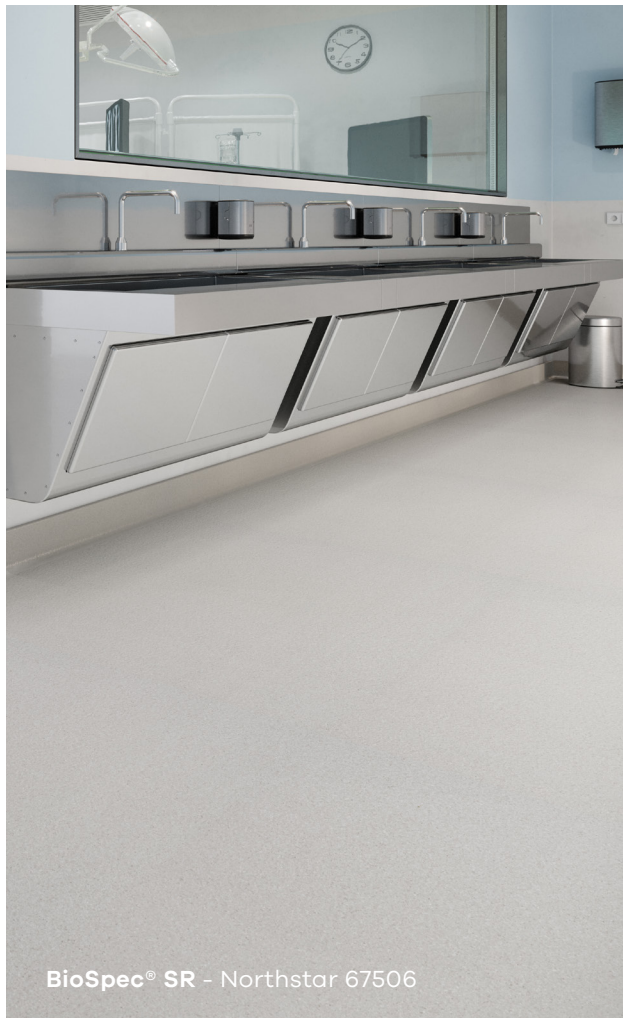
BioSpec® SR - Northstar 67506

BIOSPEC® SR OFFERS 12 COLORS OF BEST IN CLASS ABRASION RESISTANCE, SLIP RESISTANCE, EASY TO MAINTAIN STAIN RESISTANT FLOORING.