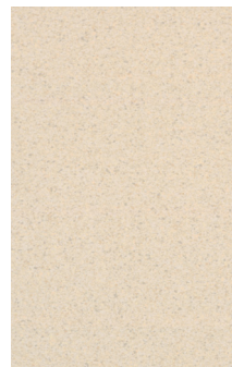
Oyster White 67201