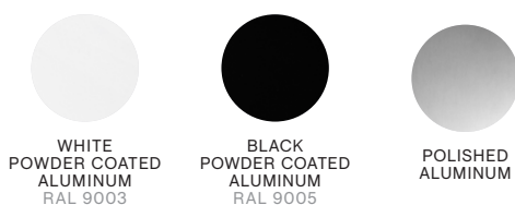
WHITE POWDER COATED ALUMINUM RAL 9003

Please note that the colour codes are indicative.