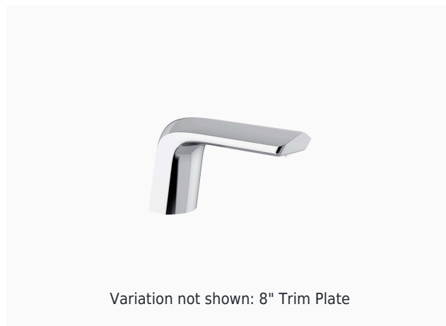
Variation not shown: 8" Trim Plate