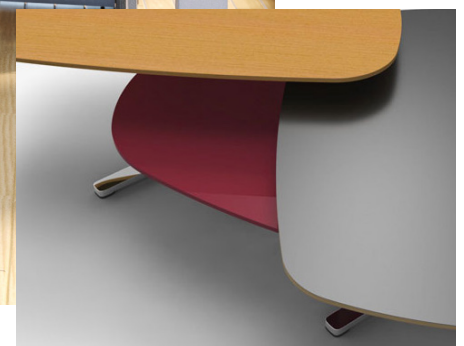
Above: X-Base table

Islands offers endless possibilities for arrangement in open spaces, meeting rooms and private offices. The collection features durable laminates and refined wood, and is available in a range of shapes, including rounded corners and elongated forms, with power and connectivity to meet today's demands.