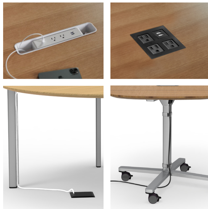
Clockwise from left to right: Drop-in Power outlet; Surface Mounted Power Square; X-Base table leg utilizes cable clips; SL-Base table leg utilizes wire cover.

X-Base tables securely manage cables from the table surface to the floor via clear wire clips that snap over the X-Base center column.