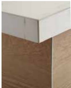
3+ and 5.6mm Using Profiles