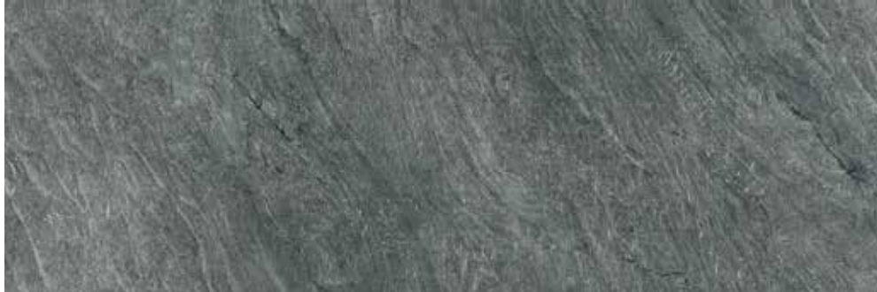
Pietra-Di-Cardoso Grigio Flamed - L9363- 5.6

Inspired by Pietra del Cardoso, a deep-blue grey sandstone mined only in the Apuan Alps, In-Side combines the mixture of natural raw materials with variable grain sizes, resulting in a textural, blended material that is typical of natural stone.