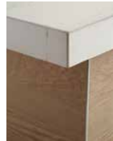
5.6mm Back Mitered and Epoxied