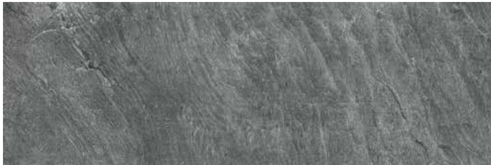
Pietra-Di-Cardoso Grigio Natural - L9362- 5.6

Note! These samples depict base color and sheen. Please refer to our website for a more accurate depiction of veining and pattern. *See chart on the next page for further information