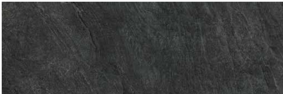
Pietra-Di-Cardoso Nero Natural - L9364- 5.6