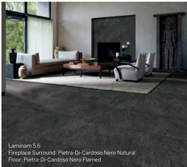
Laminam 5.6 Fireplace Surround: Pietra-Di-Cardoso Nero Natural Floor: Pietra-Di-Cardoso Nero Flamed