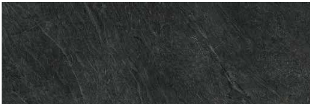
Pietra-Di-Cardoso Nero Flamed - L9365 - 5.6