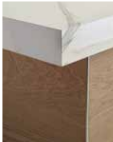
5.6mm Field Applied Bullnose