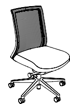
Armless W26" D26" H38½-43" Seat: W18¼" D17-22" H17½-22"