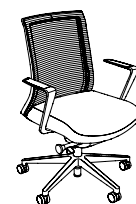
Conference Arm W26" D26" H38½-43" Seat: W18¼" D17-22" H17½-22"