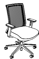
1D Arm W26" D26" H38½-43" Seat: W18¼" D17-22" H17½-22"