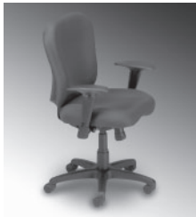
Task Chair (KI62/JR39)