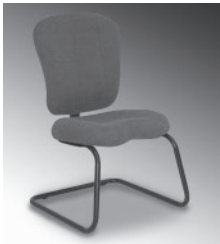
Sled Base Chair (KI60S)