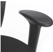
Adjustable T-Arm (JR39)