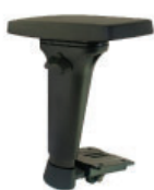
4D T-Arm (JR69)