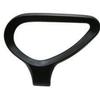
Fixed Loop Arm (KR48)

A stamped steel dual housing forms a sturdy cradle for the seat. There are two control levers. One lever actuates the pneumatic cylinder, which adjusts the seat height with infinite selection within the range (KI62). One lever locks the chair in several positions or actuates the free-floating mode. The synchronized 2:1 free floating mode has adjustments of 8° on seat and 16° on back.