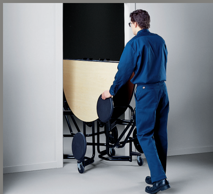
With ample doorway clearance, tables can be safely moved in the closed and locked position through standard door openings.