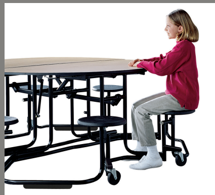
Seat support design allows easy egress from either side.