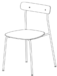
PL-10 Chair Armless