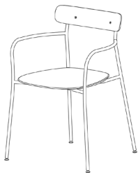
PL-15 Chair Arm