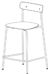
PL-20 Barstool COUNTER Height