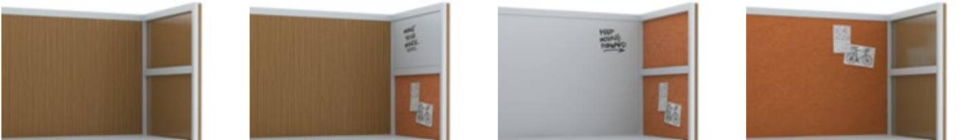
No Felt Felt in the Middle Section Shown with Markerboard. Felt in the Upper Half Shown with Markerboard Back. Felt on Back