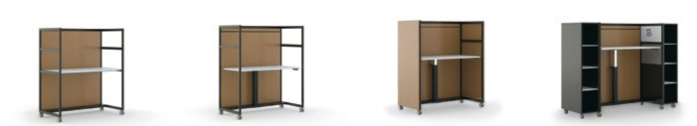
Fixed-Height Work Cart Shown without Accessory Rail. Adjustable-Height Work Cart Shown with Accessory Rail. Work Cart with End Panels Shown with Accessory Rail. Work Cart with Storage Cabinets Shown with Accessory Rail, Markerboard and Tackable Felt.