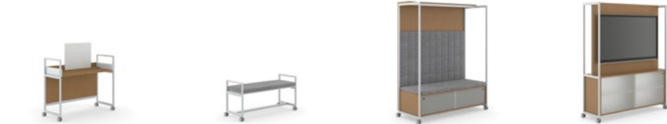
Open Utility Cart Shown with Modesty Panel and Markerboard. Seat Cart Seat Cart with Open Storage Shown with Sliding Door and Tufted Back Cushion. Media Cart Shown with Sliding Door.