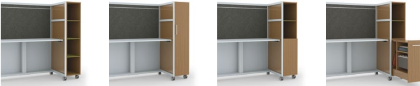
Open-Shelf Storage Cabinet Hinged-Door Storage Cabinet Open-Shelf with Hinged-Door Storage Cabinet Open-Shelf with Slide-Out Storage Cabinet