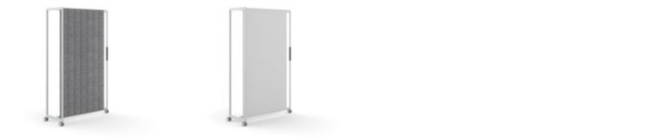
Tri-Pod Screen Cart Shown with Tufted fabric. Tri-Pod Screen Cart Shown with Translucent White Fabric.