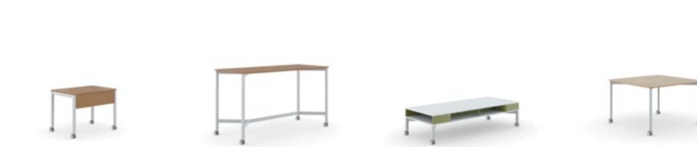
Work Desk Shown with Modesty Panel. Standing-Height Table Occasional-Height Multi-Purpose Table. X Frame with Round Legs Available in Metal. Also available with Square Legs & D Legs.