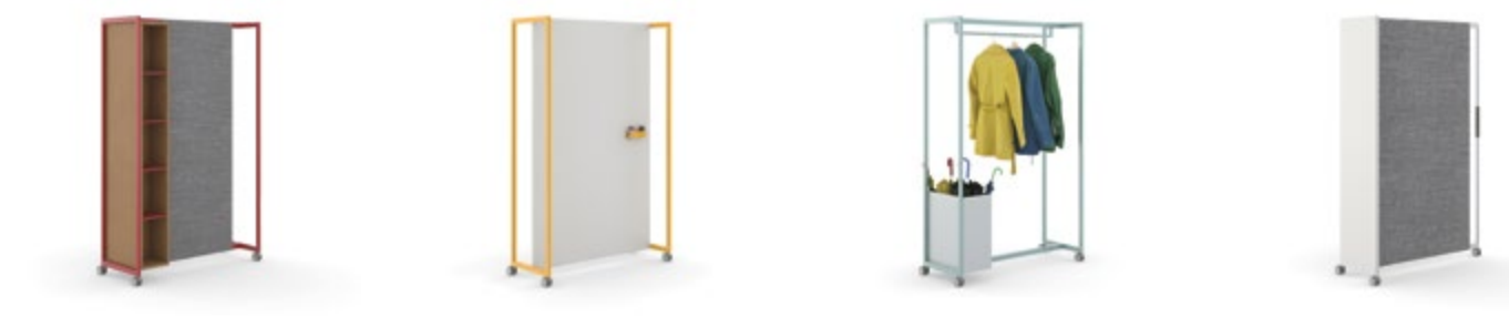
Screen Cart with Storage Shown with Fabric. Magnetic Markerboard Cart Shown with Magnetic Marker/Eraser Holder. Wardrobe Cart Tri-Pod Screen Cart Shown with Fabric and Side Insert Markerboard.