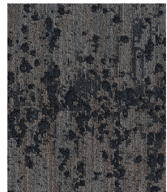
A la Mode, by Sara Meier An abstract design that alludes to the glitz and glamour of fashion; with multiple pattern layers translating into a contemporary, organic visual.