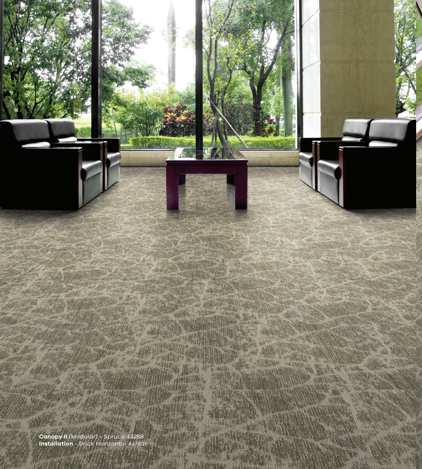
Canopy II (Modular) - Spruce 43288 Installation - Brick Horizontal Ashlar