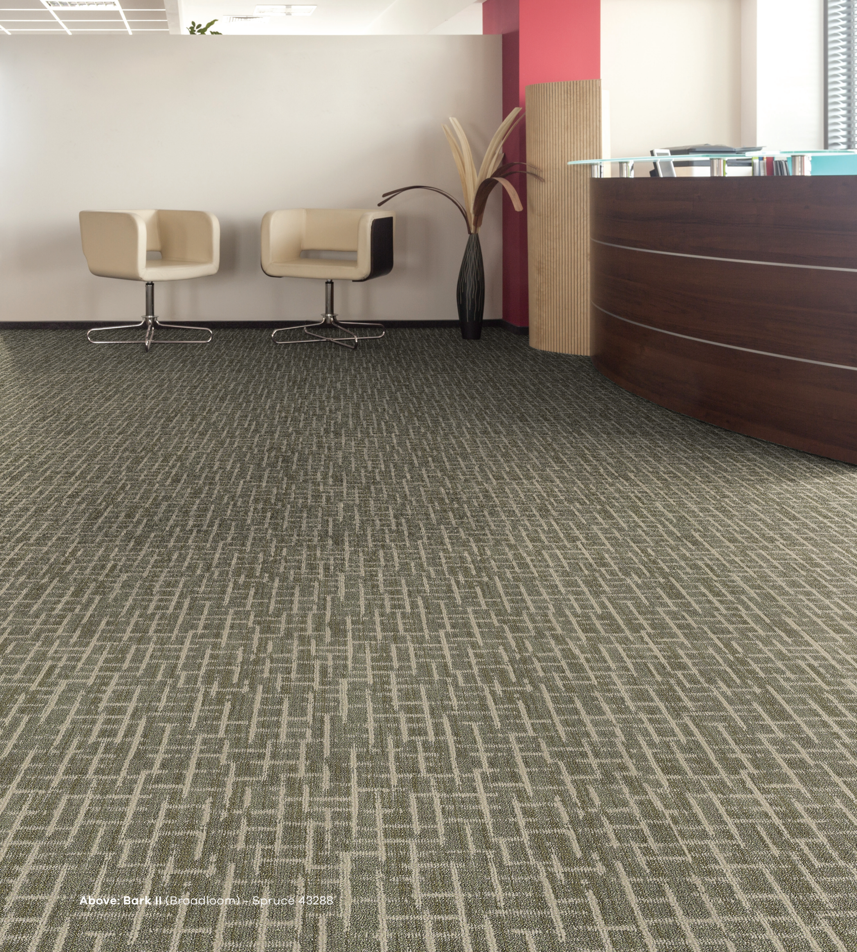
Above: Bark II (Broadloom) - Spruce 43288