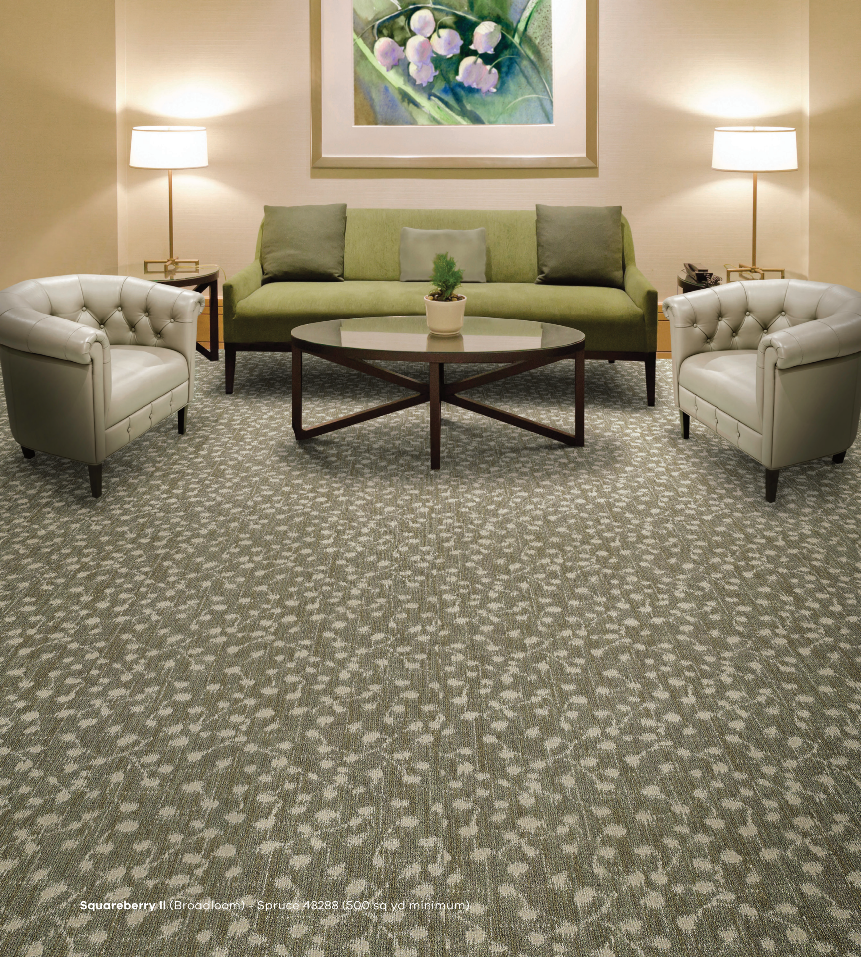
Squareberry II (Broadloom) - Spruce 43288 (500 sq yd minimum)