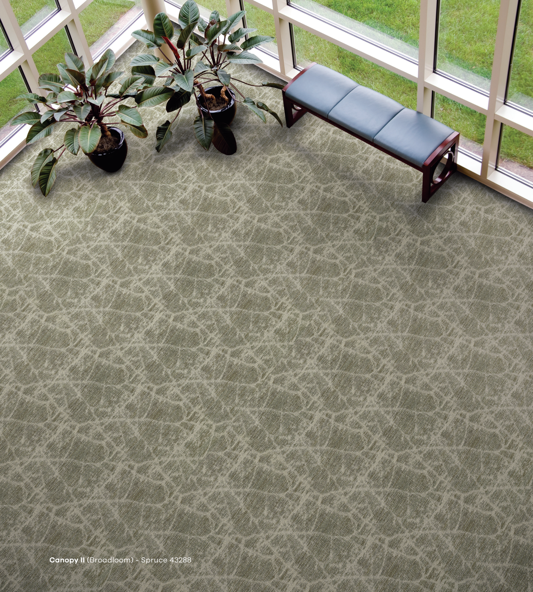
Canopy II (Broadloom) - Spruce 43288