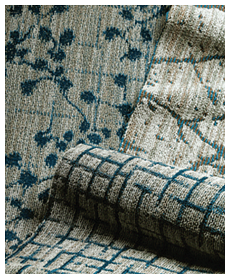
Squareberry II, by Meagan Webb Inspired by the perfect design of details in natural landscapes. Combining simple forms with a geometric grid, in delicate rhythm.