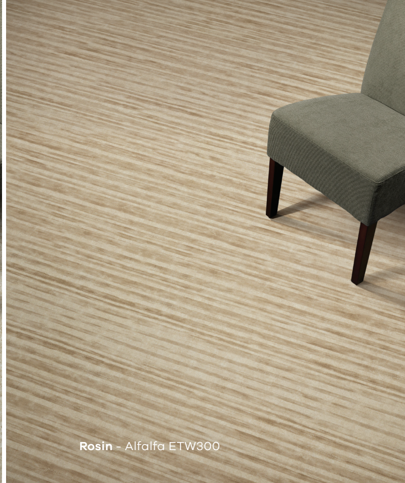
Rosin - Alfalfa ETW300