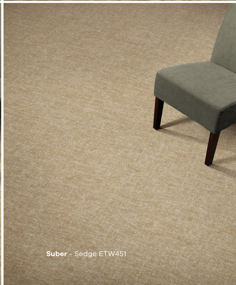
Suber - Sedge ETW451