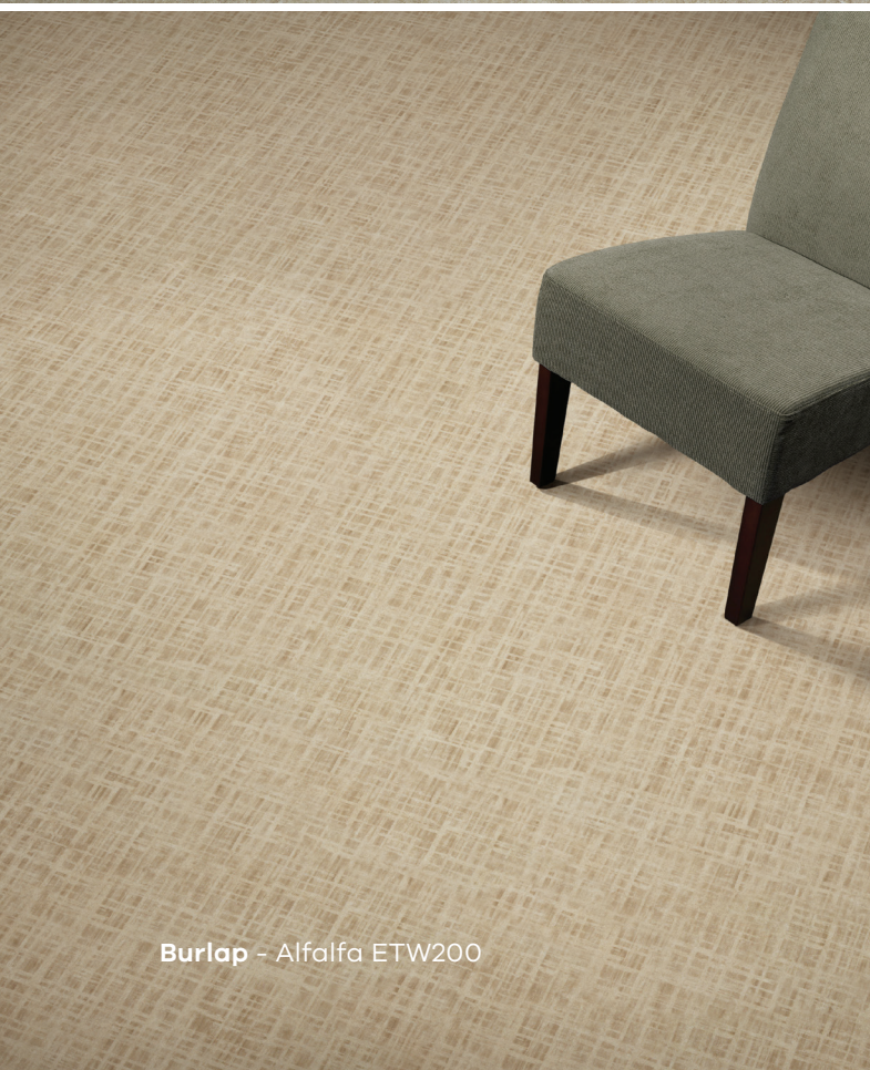
Burlap - Alfalfa ETW200