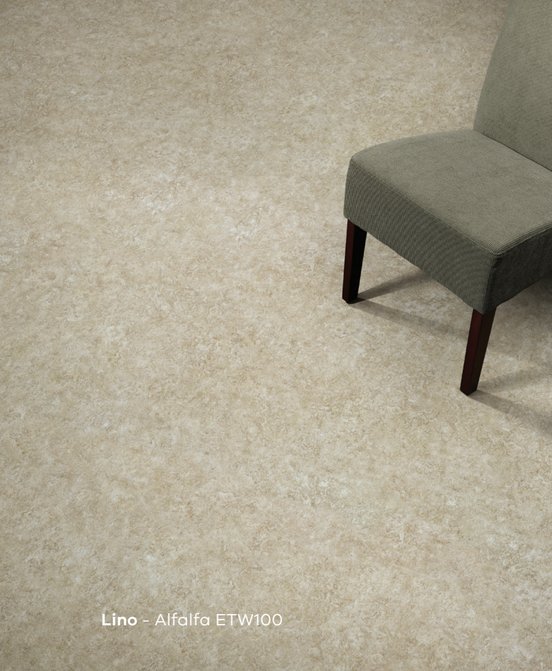
Lino - Alfalfa ETW100