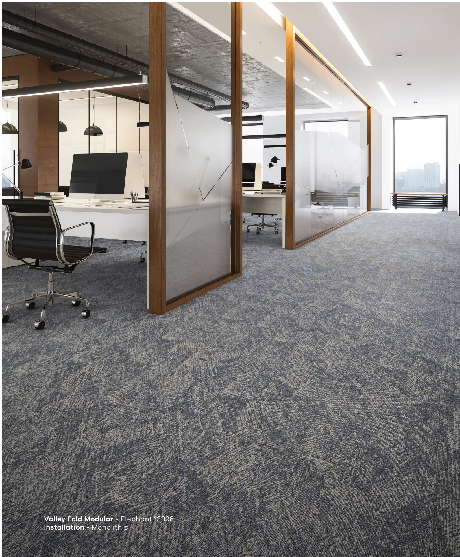
Valley Fold Modular - Elephant 13396 Installation - Monolithic