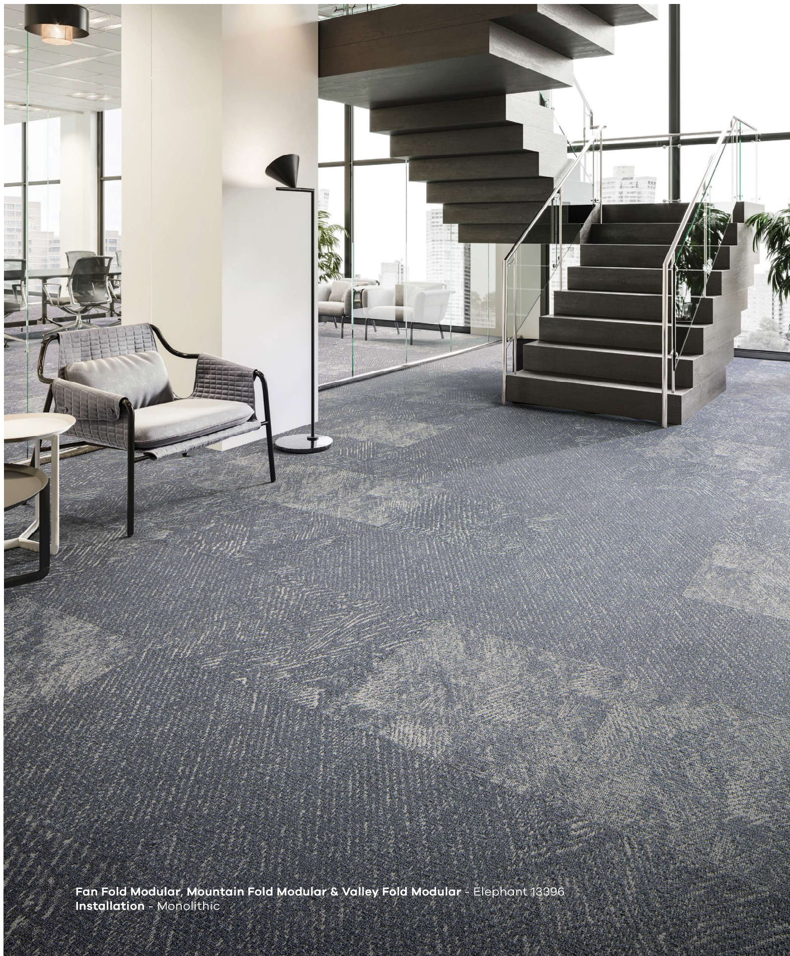
Fan Fold Modular, Mountain Fold Modular & Valley Fold Modular - Elephant 13396 Installation - Monolithic