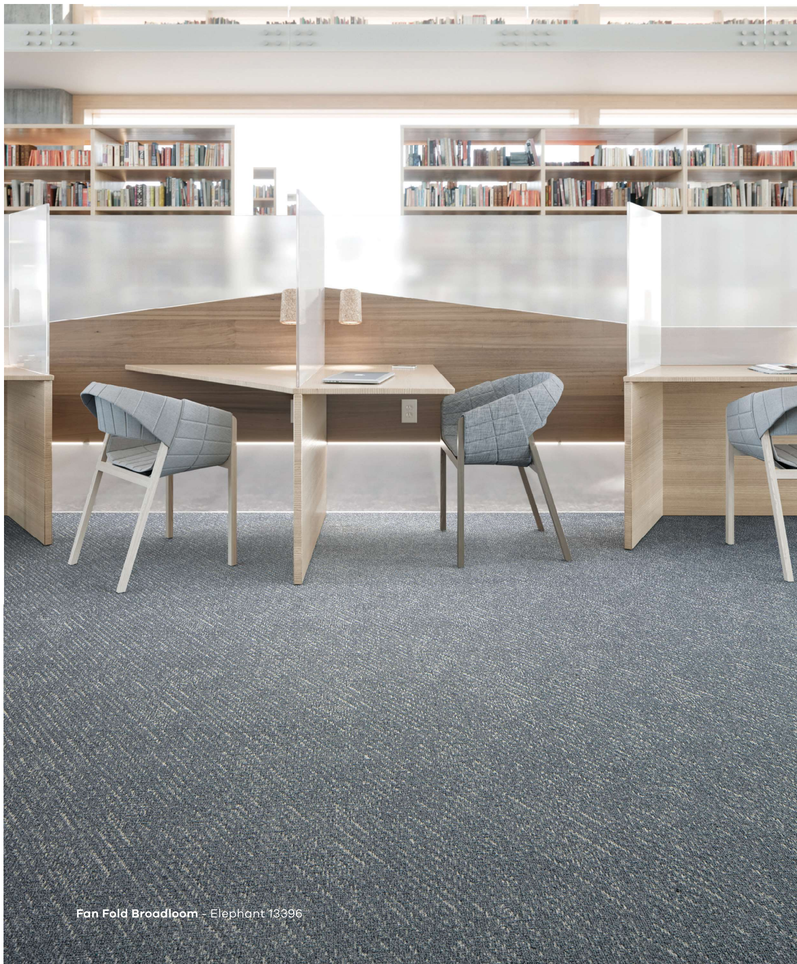
Fan Fold Broadloom - Elephant 13396