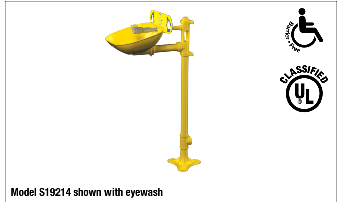
Model S19214 shown with eyewash

The Halo eye/face wash system offers a high performance rinsing platform that provides rapid relief to an individual's eyes and face that have been injured by chemicals or particulate. This system provides the most complete face wash available in the market. The eye/face wash includes an integral 5.1 gpm (19.2 Lpm) flow control, providing water at a safe velocity while maintaining its effectiveness (exceeds minimum water flow of 3.0 gpm (11.4 Lpm) at 30 psi (2.0 bar)). Eye/face wash is protected by flip-open dust covers that open when product is activated or by a full bowl dust cover that activates the unit when it is opened. Safe, steady water flow under varying water supply conditions from 30–90 psi (2.0–6.1 bar) is assured by integral flow control in the sprayhead assembly. Sprayheads are made from an impact-resistant ABS plastic, or from durable 316 stainless steel with electro-polished finish.