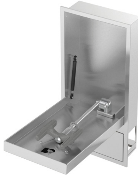
S19294JB in the open position