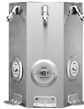
WS-3W Wall-Mounted Shower: 3-station shower with TouchTime® valve.