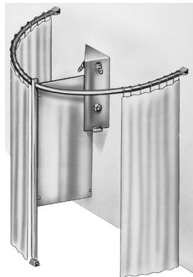
WS-2W-MS Privacy Shower: 2-station Econo-Wall multi-stall shower.