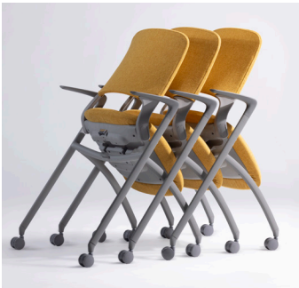
Stacks and nests for ultimate flexibility