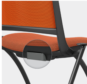
Latch locks the seat in place