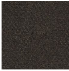
Plum Brulee' 37777