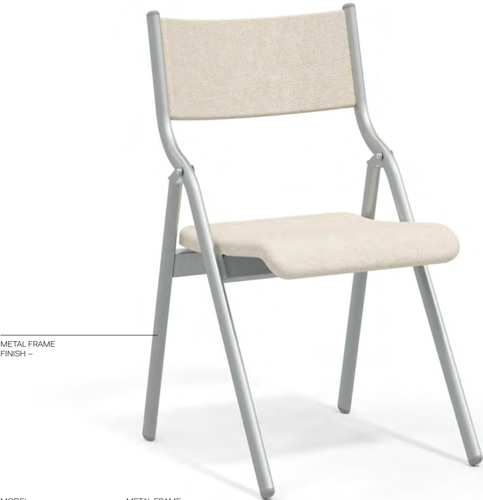
METAL FRAME FINISH –