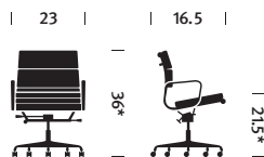
*Adjustable height, +/- 2" Pneumatic with Casters