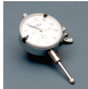
Analog Dial Indicator

Visit us at www.ctmachineworks.com or call us at 800-237-7841 for more information.