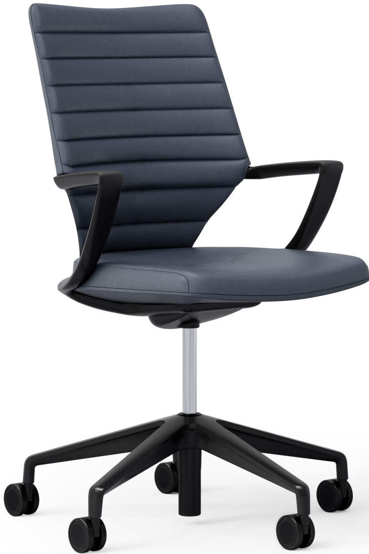
Swurve 79101 Mid channel back conference chair with 5-Star aluminum base, upholstered in Wyoming Marine

Swurve 79100/79101 can be upholstered in most Keilhauer textiles and all Keilhauer faux leathers and leathers.