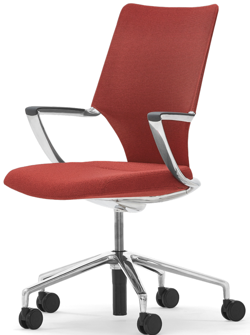
Swurve 79001 Mid mesh back office chair, mesh back in Tulip, seat upholstered in Vicolo Tulip, 5-star aluminum base