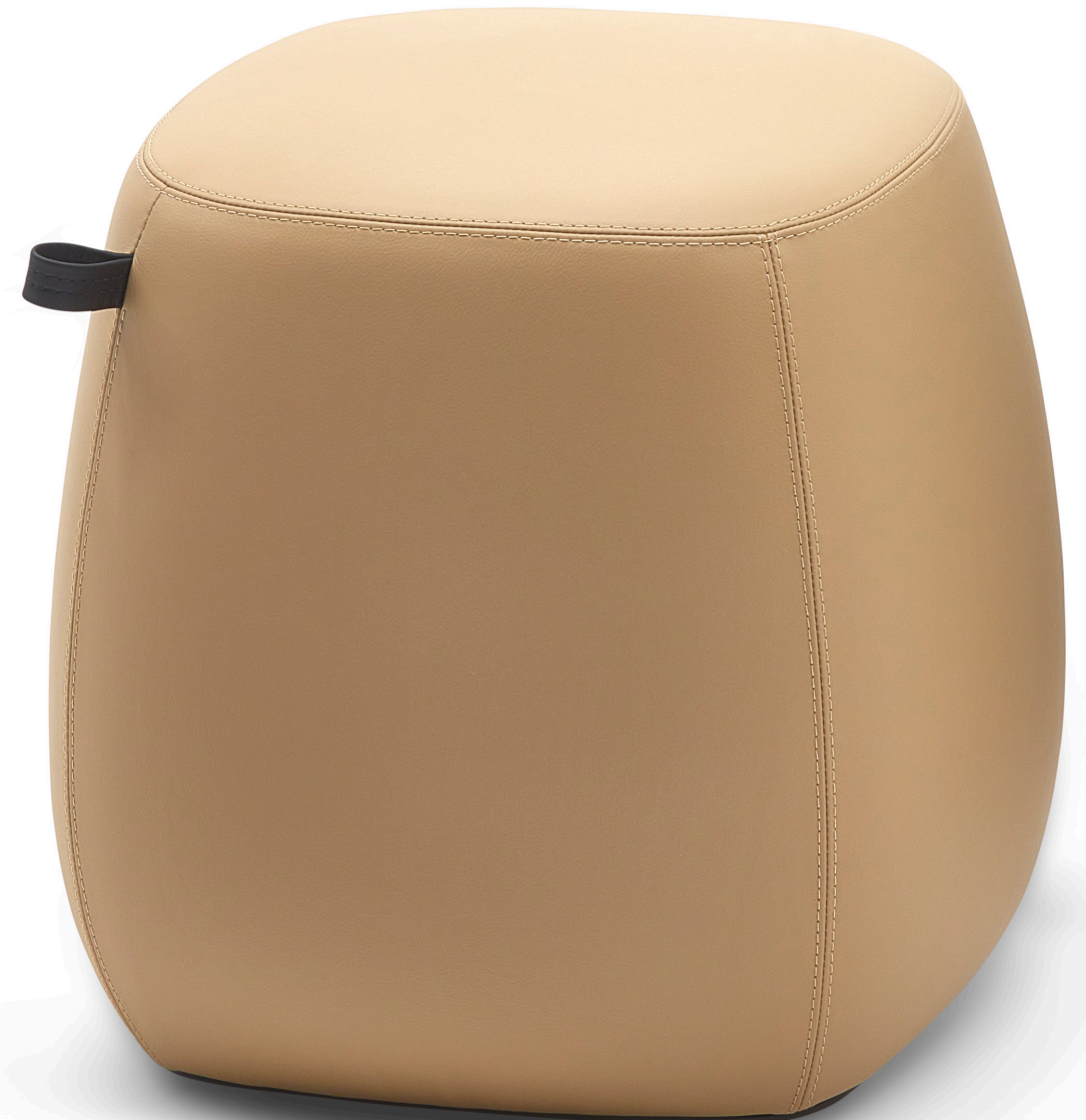
84000 Vagabond ottoman upholstered in Kenora, Ambrosia.