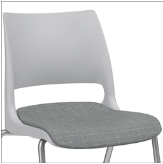
Solid Poly with Upholstered Seat