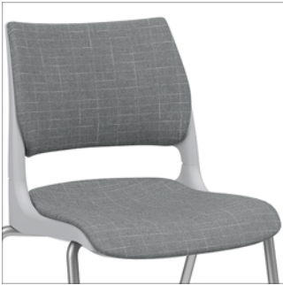
Solid Poly with Upholstered Seat and Back