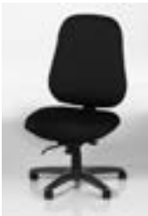
Pilot Armless Chair (KI88/NA)