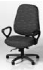
Pilot Task Loop Arm Chair (KI88/KR48)