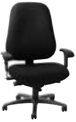
Pilot Task T-Arm Chair (KI88/KR300)