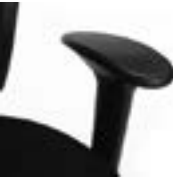
Adjustable T-Arm (JR39)