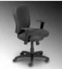
Task Chair (KI62/JR39)