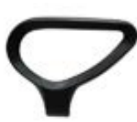
Fixed Loop Arm (KR48)

Not all materials are suitable for upholstering this product. A 1-1/2 yd. x 54" sample must be submitted and approved prior to acceptance of an order. If the fabric is directional in pattern or weave, the direction must be indicated on the submitted sample, and additional yardage may be requested.