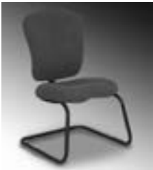
Sled Base Chair (KI60S)