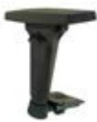
4D T-Arm (JR69)