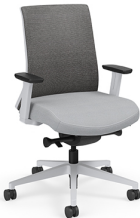
Signia Task Chair ›

Delivering a beautiful, fully ergonomic, long-term sitting experience in your choice of task chair or stool.