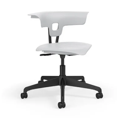
Task Chair >