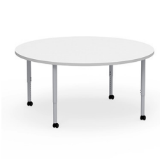
Activity Table >