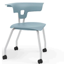
18" Seat Height with Casters W28" D29" H29.5" Seat: W22.3" D18.8" H18"