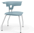
18" Seat Height with Glides W28" D29" H29.5" Seat: W22.3" D18.8" H18"