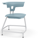
18" Seat Height with Glides W28" D29" H29.5" Seat: W22.3" D18.8" H18"