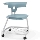
18" Seat Height with Casters and Book Bag Rack W28" D29" H29.5" Seat: W22.3" D18.8" H18"