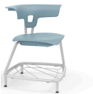
18" Seat Height with Glides and Book Bag Rack W28" D29" H29.5" Seat: W22.3" D18.8" H18"