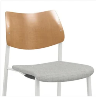
Upholstered Seat and Wood Back