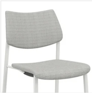
Upholstered Seat and Back