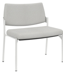
XL Bariatric Chair