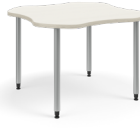
Ruckus® Activity Table