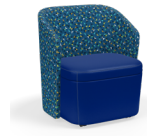
Sonrisa™ Lounge Seating