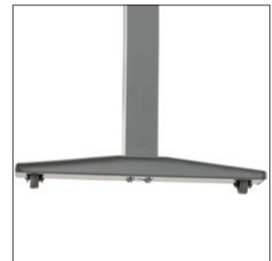
Rolling base option

Learn more about WorkUp Adjustable Table