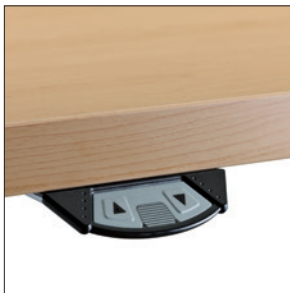
Standard electric control