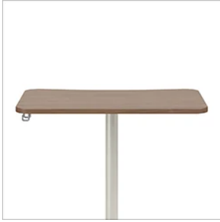
Book Bag Hook