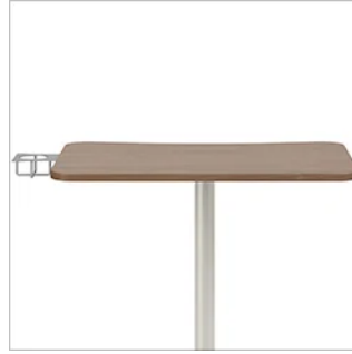
Swiveling Cup Holder