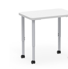
Ruckus Post-Leg Desks >