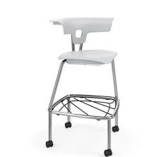
Ruckus Stool >