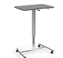
Ruckus Lectern >