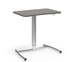
Ruckus Cantilever Desks >