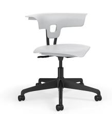
Ruckus Task Chair >