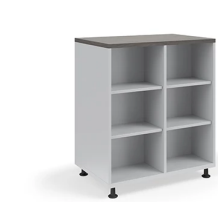
Ruckus Storage >