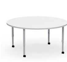
Ruckus Activity Tables >