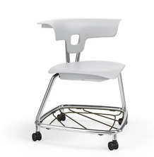
Ruckus Chair >

It's not so much an evolution as a revolution. It looks like nothing else. It can be used like nothing else. It's Ruckus: a simple, inspiring and incredibly innovative collection that supports today's learning space transformations.