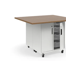
Ruckus Worktables >