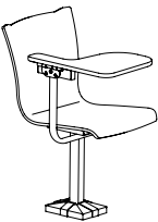
Apply Seat: W17½" D17⅜" H17½"