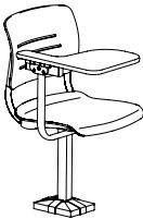
Grazie Seat: W18½" D18⅝" H17¾"