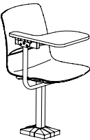
LimeLite Seat: W18¼" D17½" H17½"