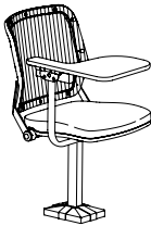
Torsion Air Seat: W17" D18½" H18"