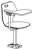
Intellect Wave Seat: W17½" D17" H18"