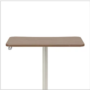
Book Bag Hook *Available Left- or Right-Side