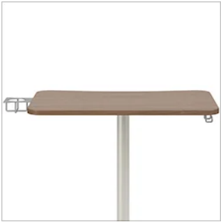
Swiveling Cup Holder and Book Bag Hook *Available Left- or Right-Side