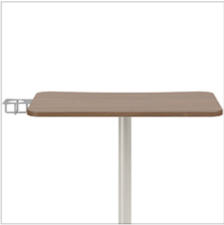
Swiveling Cup Holder *Available Left- or Right-Side