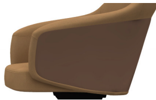
Paint or studio paint