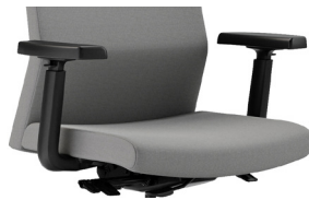
4d pivoting arms - CR13