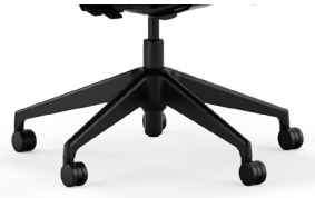
Base Standard black nylon base - TT