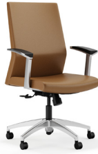
High back 3510 26"w x 26"d x 41.25/47.25"h