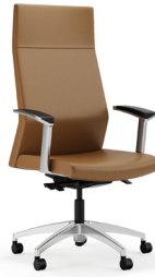
Executive high back 3515 26"w x 26"d x 46.25/51.25"h