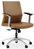
Mid back 3507 26"w x 26"d x 36/41.25"h