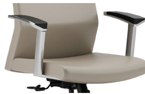
Aluminum cantilever arms - ALAR Available in polished aluminum or standard/studio powder coats