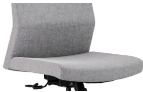
Arm No arms - standard - X9