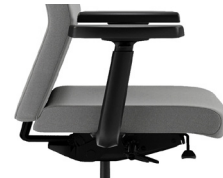
Internal back height adjustment - BH1 Available on models 3507 & 3510 with body balance control only