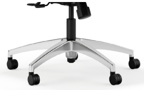
Aluminum base - ALBS Available in polished aluminum or standard/studio powder coats