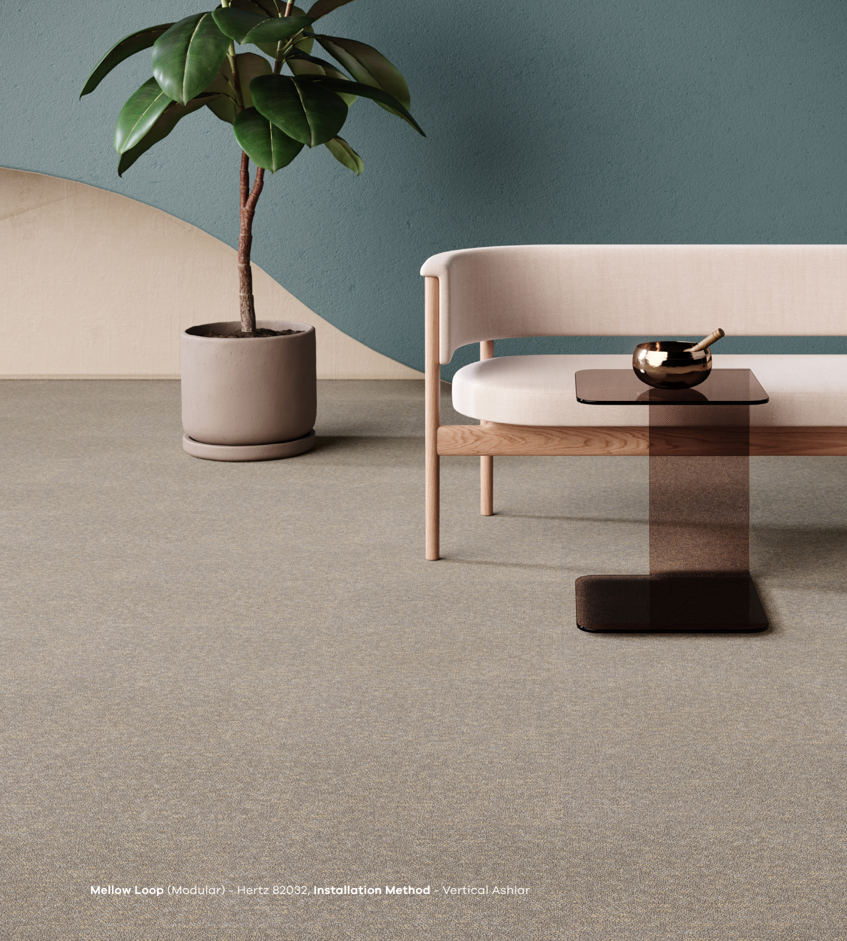
Mellow Loop (Modular) - Hertz 82032, Installation Method - Vertical Ashlar