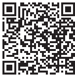
View Edge Effects Online