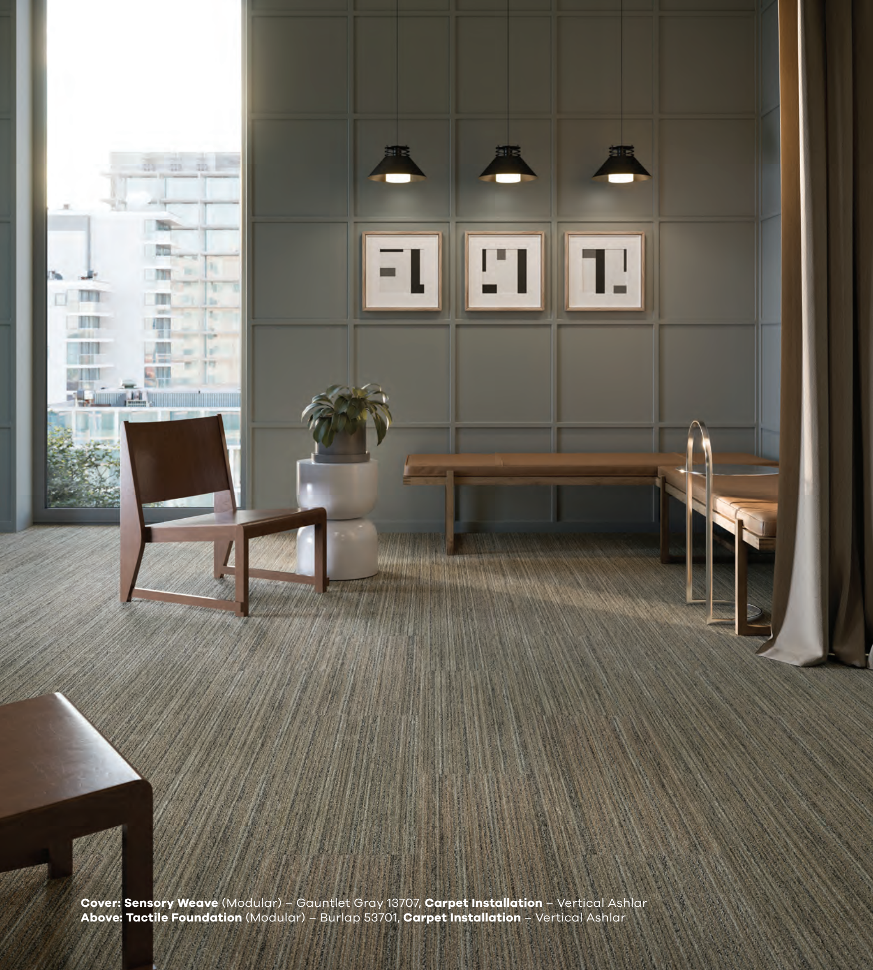
Cover: Sensory Weave (Modular) – Gauntlet Gray 13707, Carpet Installation – Vertical Ashlar Above: Tactile Foundation (Modular) – Burlap 53701, Carpet Installation – Vertical Ashlar