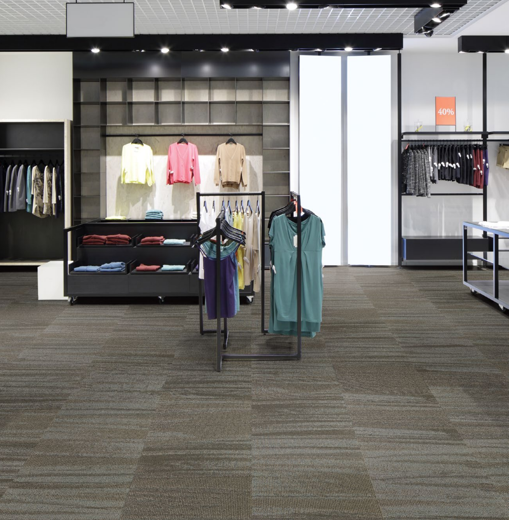
Cover: Tulle (Modular) - Sea 35557; Installation - Vertical Ashlar Above: Tulle (Modular) - Sable 42554; Installation - Vertical Ashlar