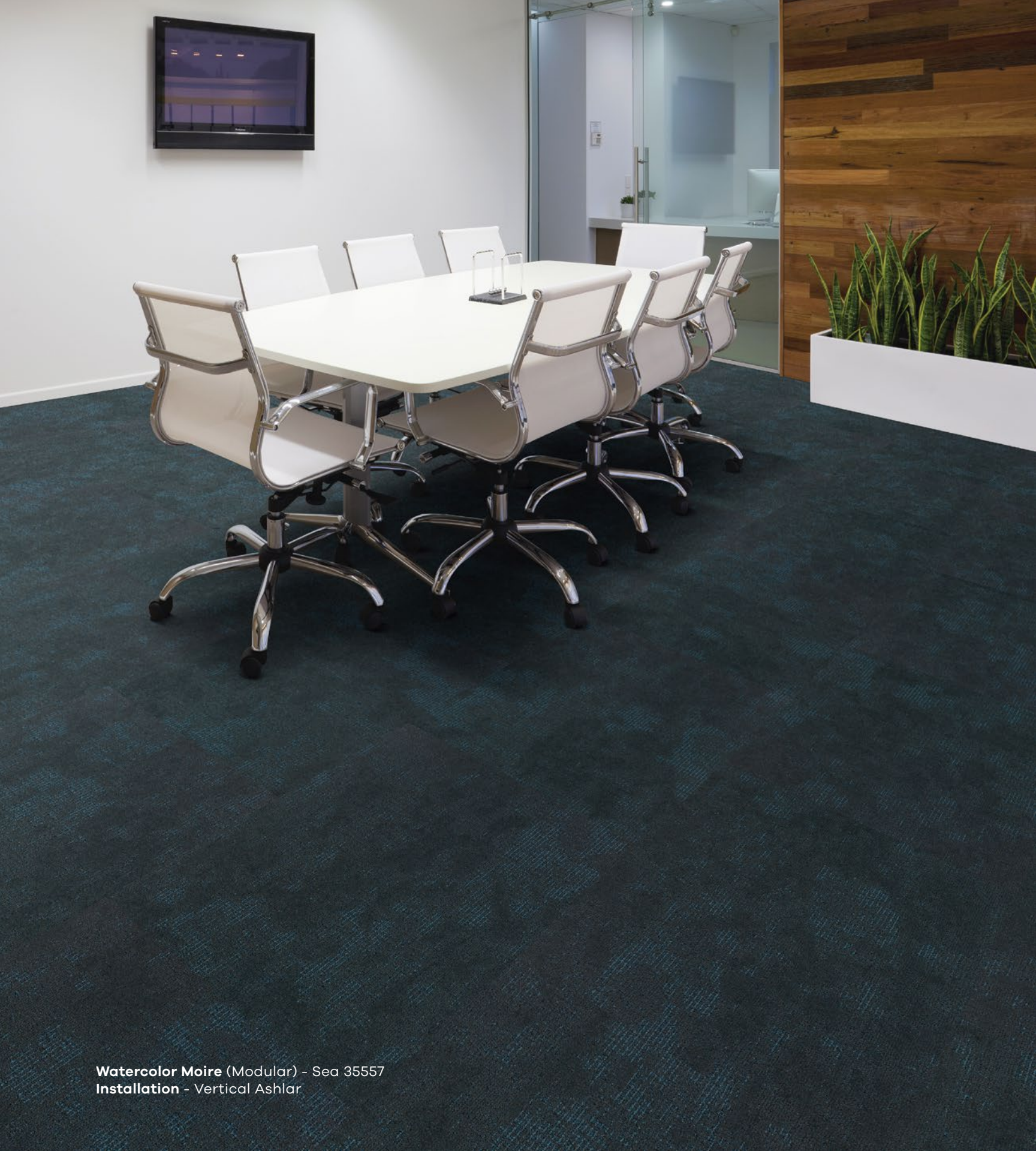
Watercolor Moire (Modular) - Sea 35557 Installation - Vertical Ashlar