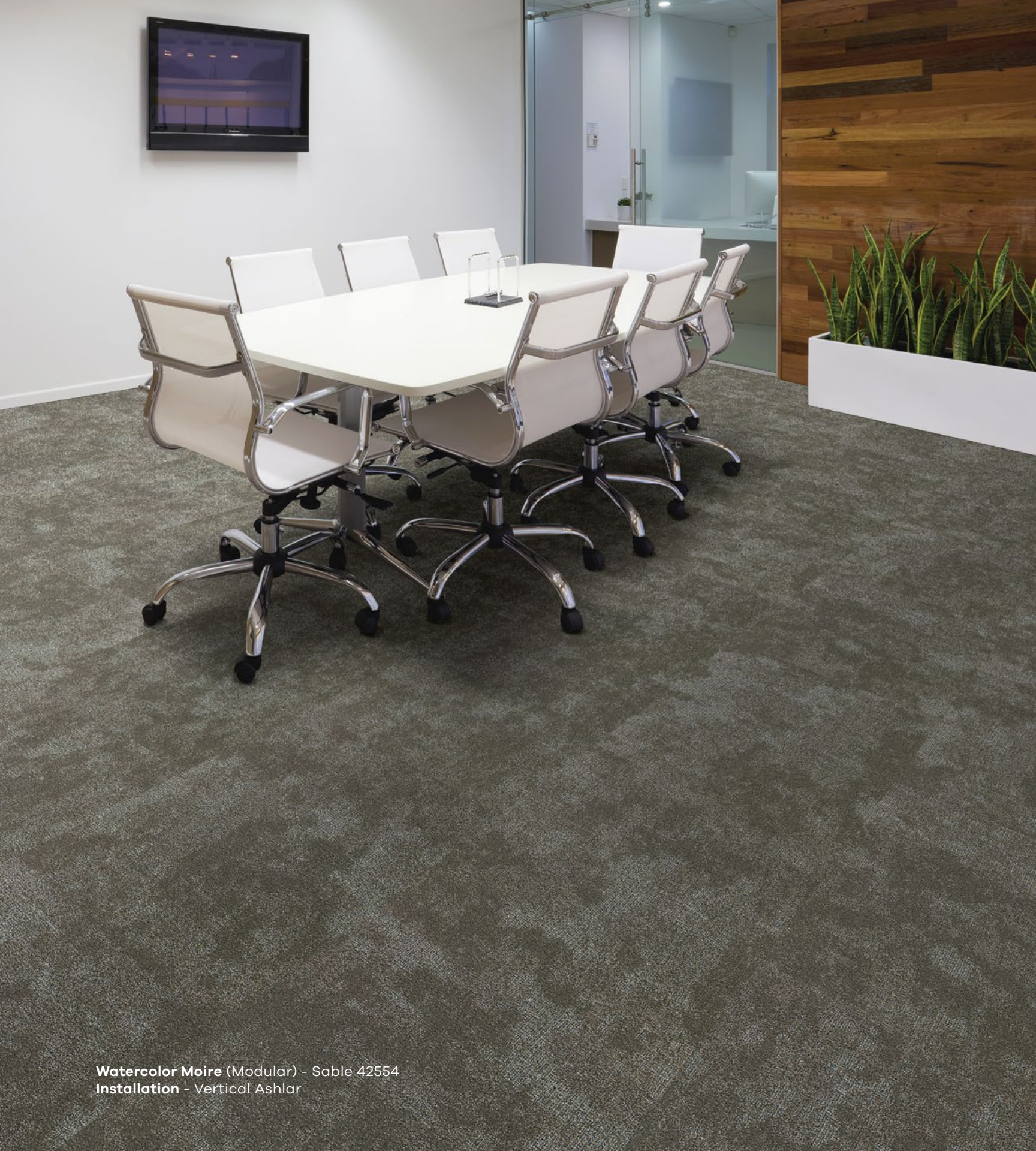
Watercolor Moire (Modular) - Sable 42554 Installation - Vertical Ashlar