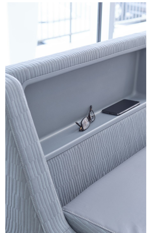
Storage cubbies located inside of exterior back