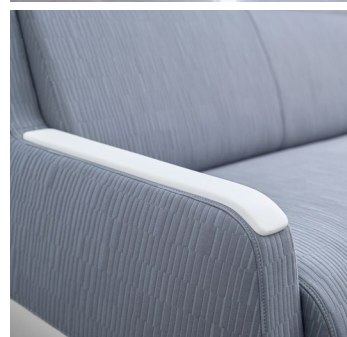
Solid surface arm caps shown in Modern White