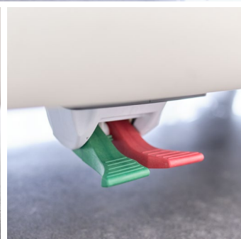
Central locking caster color-coated pedals