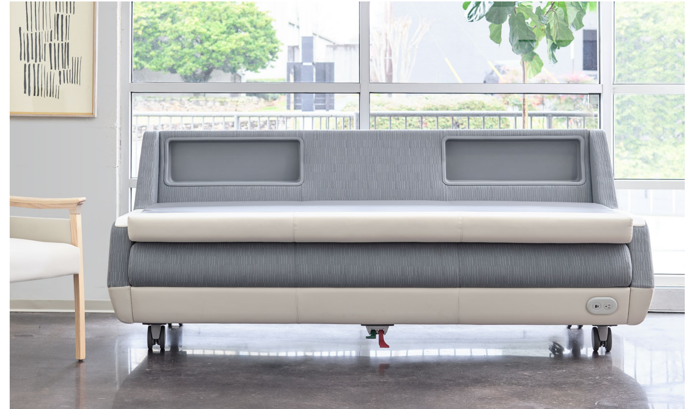
Intuitive, fold down back for sleep position