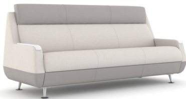
76" Sleepover with powder coated aluminum legs and solid surface arm caps