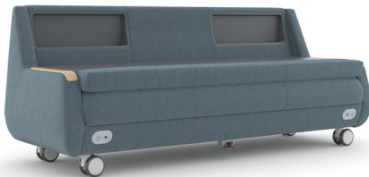
80" Sleepover with central locking casters, power, and wood arm caps