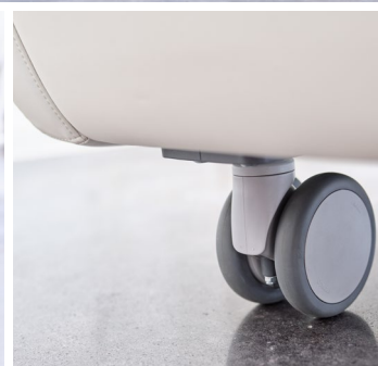
Central locking casters provide mobility for ease of use while cleaning