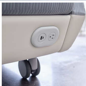
Optional 15 Amp outlet with USB and USB-C charging ports.