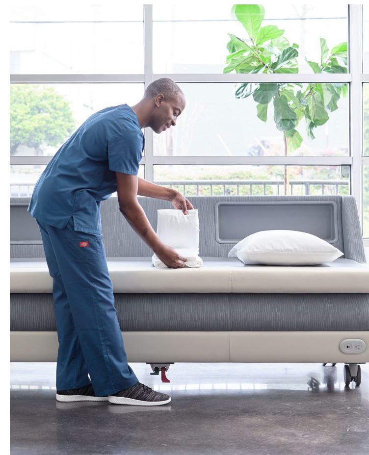
Molded foam with sinuous springs provide additional comfort for visitors