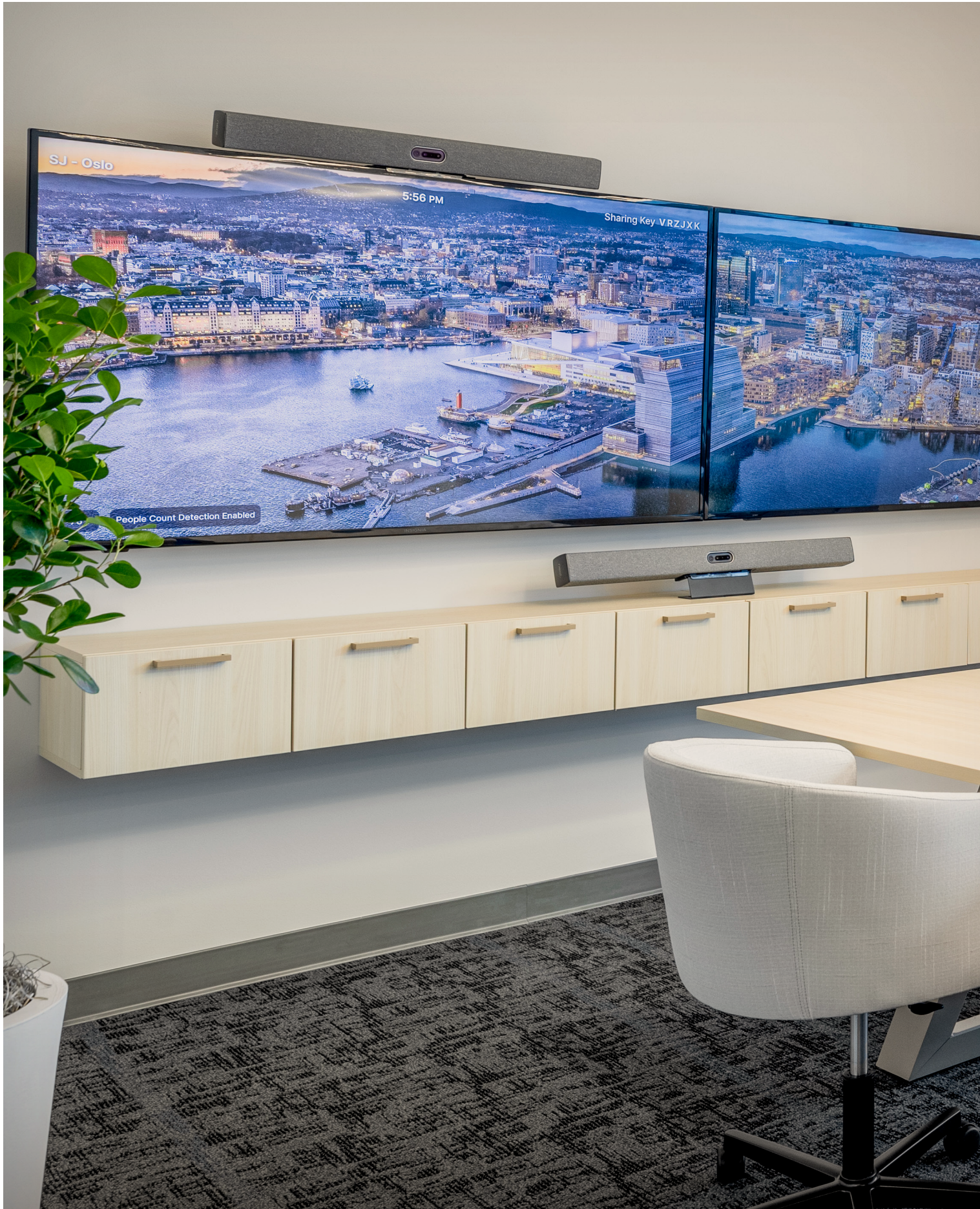
NEAT Experience Center San Jose, CA