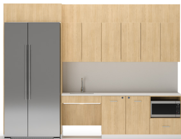
Staff respite, café & dining