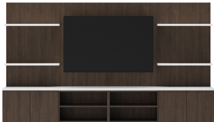
Learning, shared & training spaces