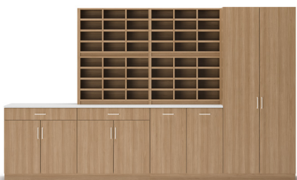
Community & team spaces