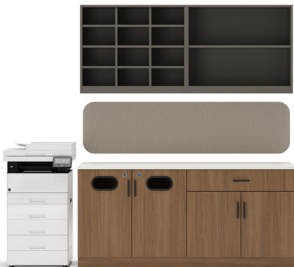
Community & team spaces