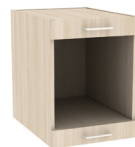
Lower & upper pull out shelf *access back optional