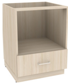
One drawer *access back optional