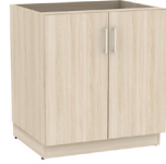
Two full doors