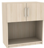
Two half doors