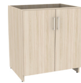
Two doors w/ open bottom