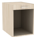
Upper pull out shelf *access back optional