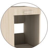
*Base cabinets detail of access back opening