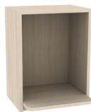
Microwave *access back optional