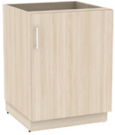
One full door