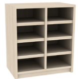
Two paper sorters