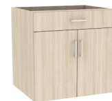
Two doors & one drawers