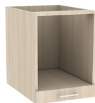
Lower pull out shelf *access back optional