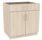
Two doors & one drawer