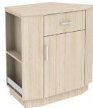
Door & drawer