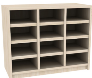
Three paper sorters