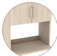
*Upper cabinets detail of access back opening