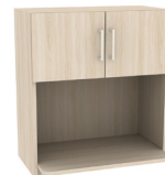
Microwave & two half doors *access back optional