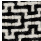
004 Black White