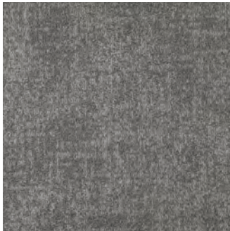
Muddy Boots FSY13