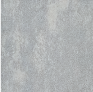
Etched Valley GLN144