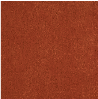
Crossing Point FSY26