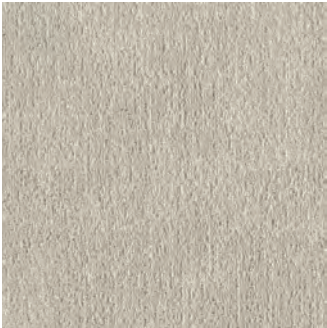
Moorland Paths FSY251