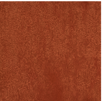
Crossing Point GLN26