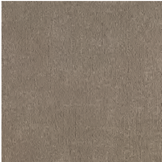
Little Knoll FSY259