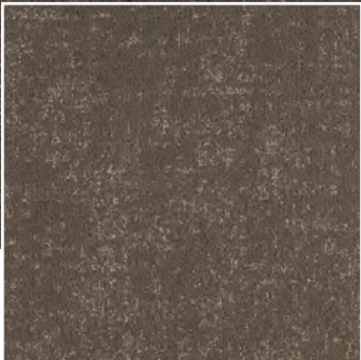
Woolly Hat FS254.