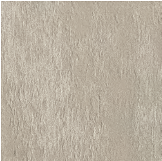
Moorland Paths GLN251