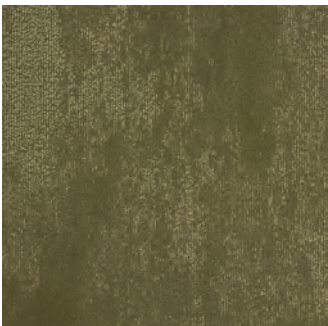
Verdant Climb GLN74