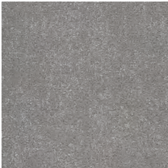
Wind Vane FSY05