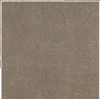
Little Knoll FS259.