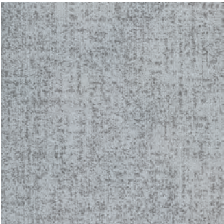
High Cliffs FSY180