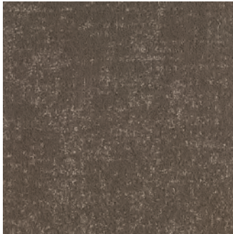
Woolly Hat FSY254