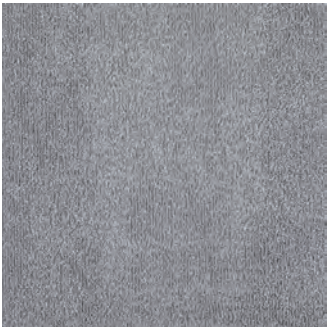
Grey Moss FSY153