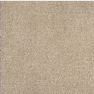
Rugged Quarry FSY204