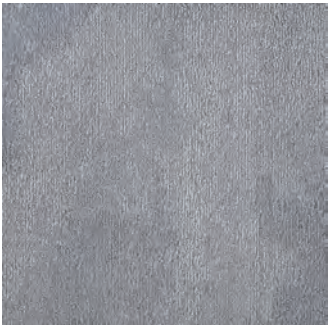
Grey Moss GLN153