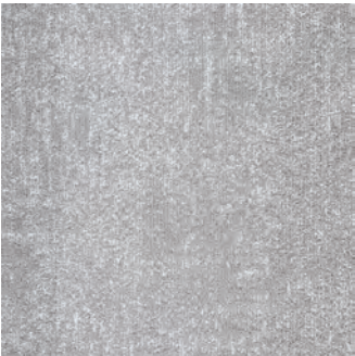
Silver Lakes FSY139