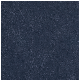
Base Layer FSY52