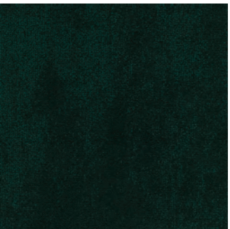
Way Marking GLN274