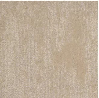
Rugged Quarry GLN204