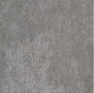
Wind Vane GLN05