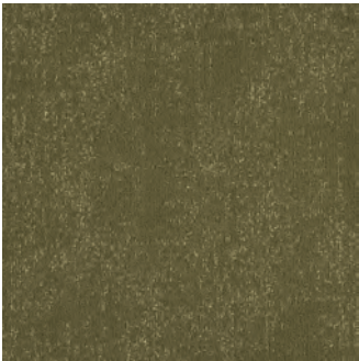
Verdant Climb FSY74