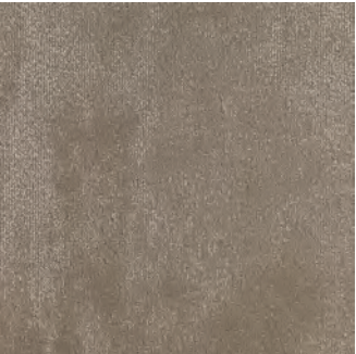
Little Knoll GLN259