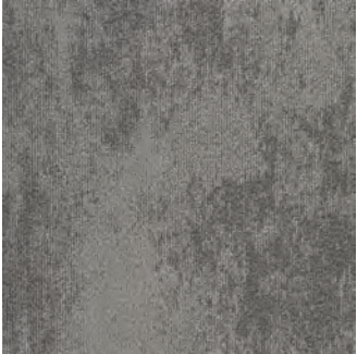
Muddy Boots GLN13