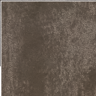
4 Woolly Hat GLN254.