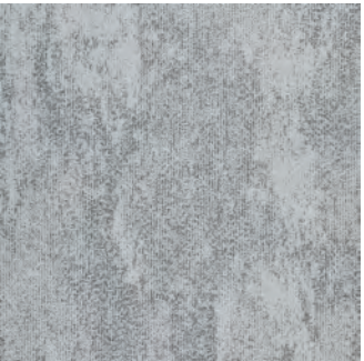
High Cliffs GLN180