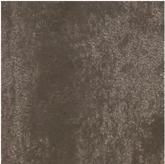
Woolly Hat GLN254