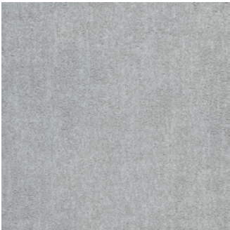
Etched Valley FSY144