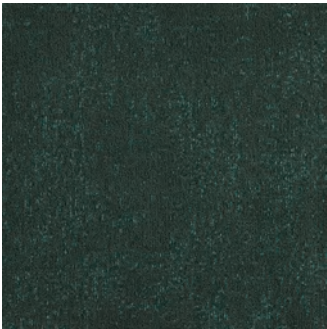
Way Marking FSY274