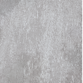
Silver Lakes GLN139