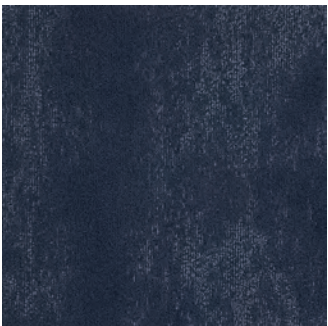
Base Layer GLN52