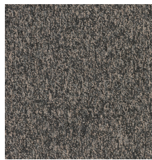
RAISED EYEBROW 24514