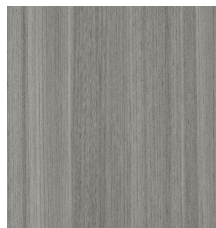
FOG-V2 00560 V2 - SLIGHT VARIATION