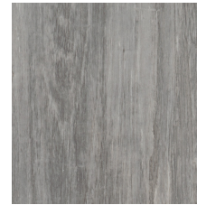
DOVE-V2 05110 V2 - SLIGHT VARIATION