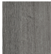
IRON-V2 00580 V2 - SLIGHT VARIATION