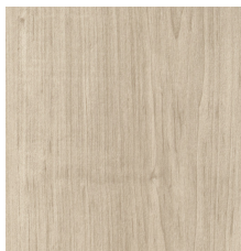
CASHEW-V2 00105 V2 - SLIGHT VARIATION