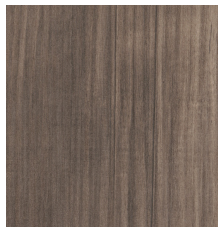
TRUFFLE-V3 07060 V3 - MODERATE VARIATION