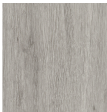
TALC-V2 00500 V2 - SLIGHT VARIATION