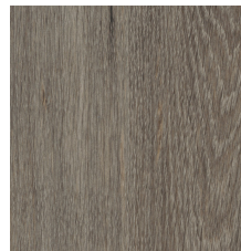
CAROB-V2 07067 V2 - SLIGHT VARIATION