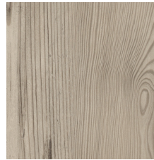
DERBY-V2 01036 V2 - SLIGHT VARIATION