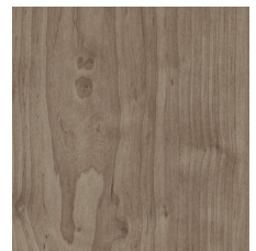
SEDONA-V2 00750 V2 - SLIGHT VARIATION