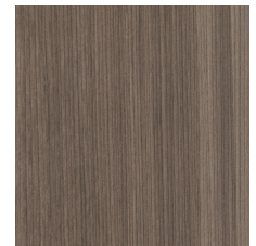
REED-V2 07213 V2 - SLIGHT VARIATION