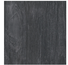
CINDER-V2 05113 V2 - SLIGHT VARIATION