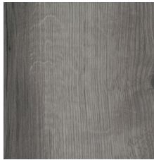
STAG-V3 00760 V3 - MODERATE VARIATION