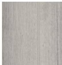
CHICKAREE-V3 00525 V3 - MODERATE VARIATION