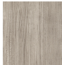
MOCHA-V2 07210 V2 - SLIGHT VARIATION