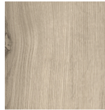
JUTE-V3 02001 V3 - MODERATE VARIATION