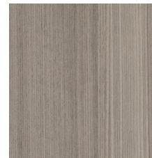
HAZELNUT-V2 07212 V2 - SLIGHT VARIATION