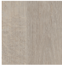
OAT-V2 01031 V2 - SLIGHT VARIATION