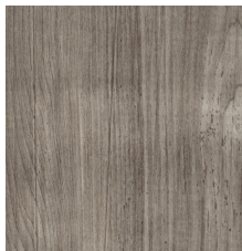
LATTE-V4 07059 V4 - SUBSTANTIAL VARIATION