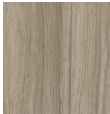
HONEY WALNUT-V2 00130