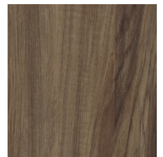
SPICED CHESTNUT-V2 00750