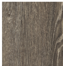
HERITAGE BROWN-V3 00730