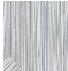
EXPLORE-V1 00485 V1 - UNIFORM APPEARANCE