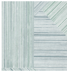
CHANGE-V1 00385 V1 - UNIFORM APPEARANCE