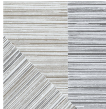
INTENTION-V1 00700 V1 - UNIFORM APPEARANCE