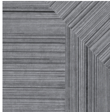
REFINE-V1 00585 V1 - UNIFORM APPEARANCE