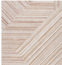
SCOPE-V1 00650 V1 - UNIFORM APPEARANCE