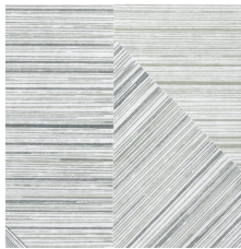
ADAPT-V1 00350 V1 - UNIFORM APPEARANCE