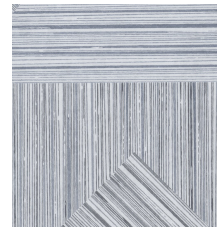
GATHER-V1 00500 V1 - UNIFORM APPEARANCE