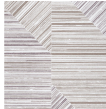
SHIFT-V1 00900 V1 - UNIFORM APPEARANCE