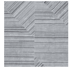
CONNECT-V1 00530 V1 - UNIFORM APPEARANCE